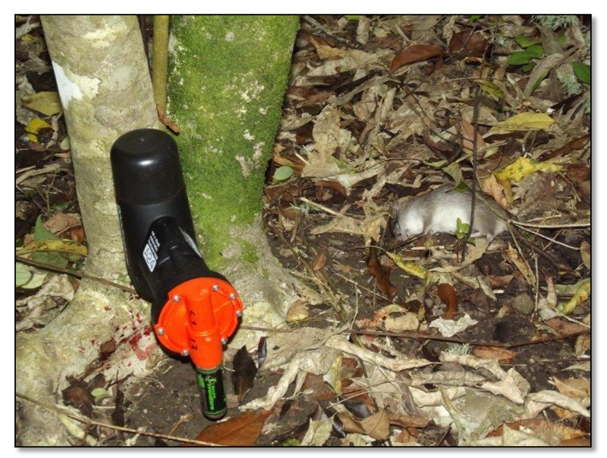
Self-resetting rat trap with dead rat.