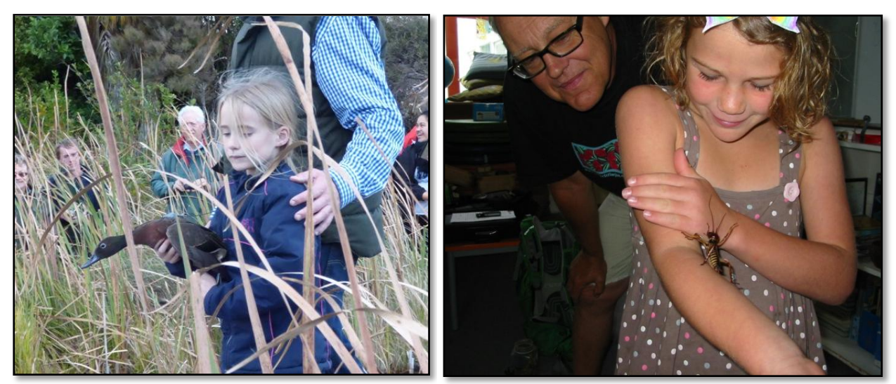
Pāteke/brown teal release May 2015.

Native species thrive where we live, work and play