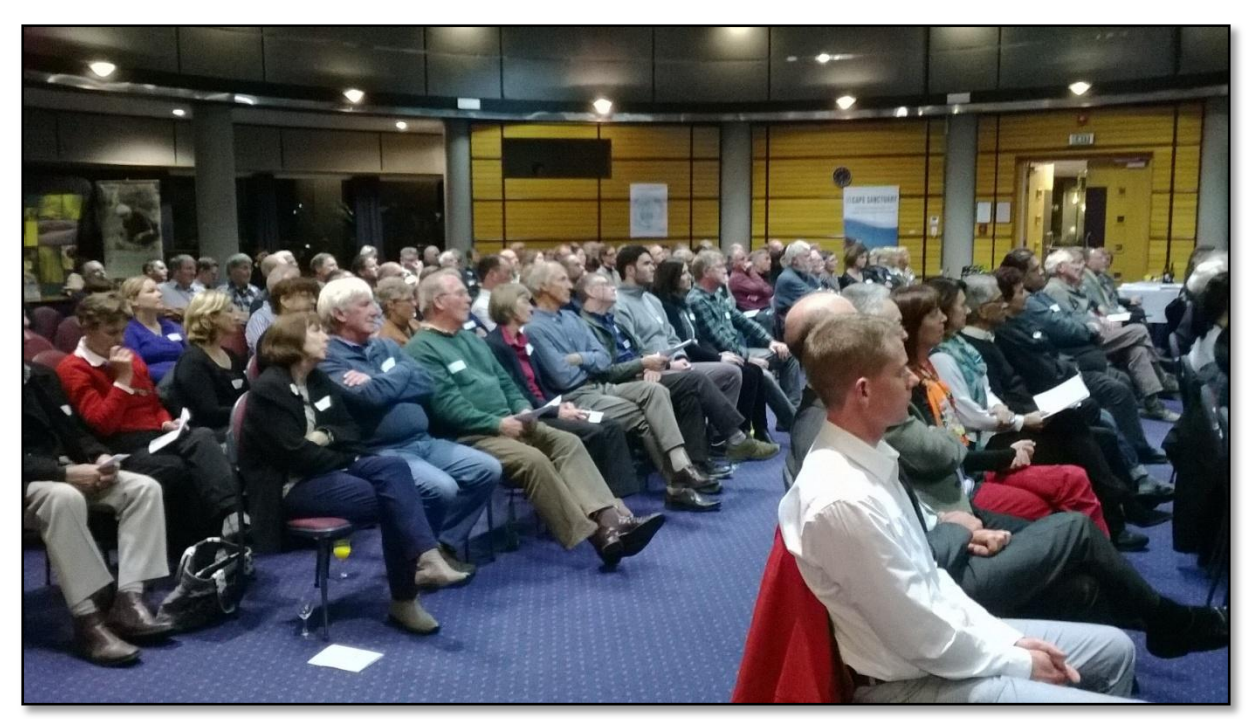
Audience at the Cape to City Launch, 30 April 30 2015.