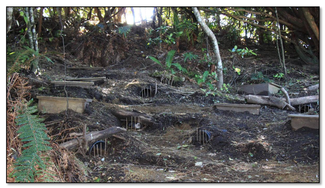
Petrel nest boxes and burrows at Boundary Stream.